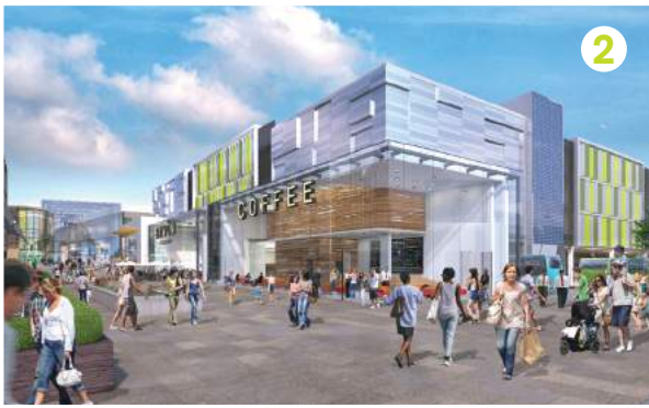
View of Broadmarsh Car Park from Canal Street