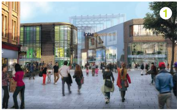
View of Intu Broadmarsh from (Upper) Carrington Street