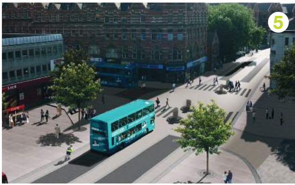
View of Canal Street and Carrington Street