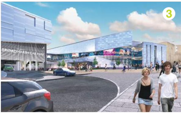
View of new cinema, entrance to pedestrianised Collin Street and Middle Hill